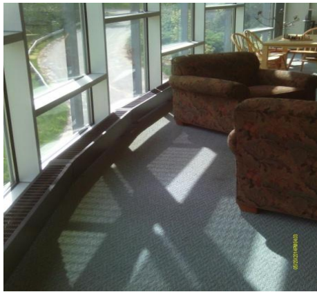
2: Fin-tube heating element along south/southwest facing wall of nearly full glazing

The heating distribution system consists of hydronic piping delivering heated boiler water to/from the various heat emitters used throughout the facility. The majority of the heat is delivered via hydronic fan coils internal to the 5 air handling units. Other heat emitting elements used for localized heating of small spaces are fin-tube radiation convectors, unit heaters and electric baseboards.