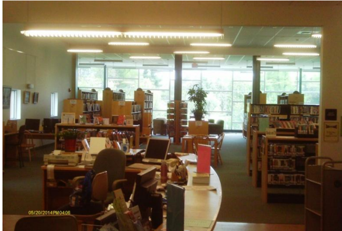
I: Circulation desk looking through the newer section

Below is a picture taken of the interior of the top floor of the Library.